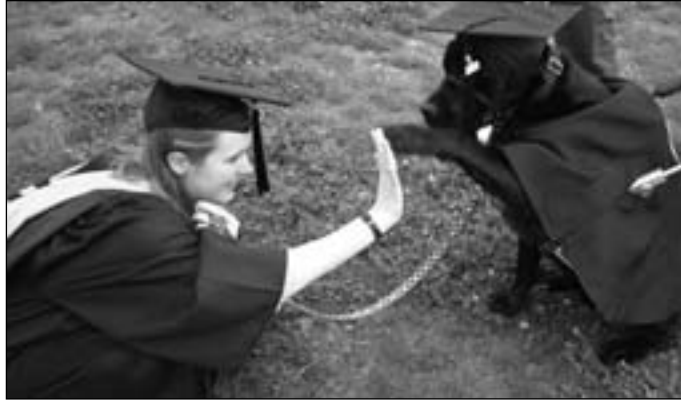
A college graduation shared because independence became a reality!"

If you are receiving duplicate copies or if you would like to be removed from our mailing list, please call (610) 869-4902, x 214.