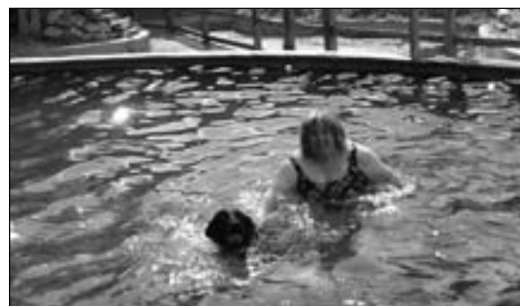
Swimming can be a very scary activity for someone with a seizure—but not with Ruby there to alert!