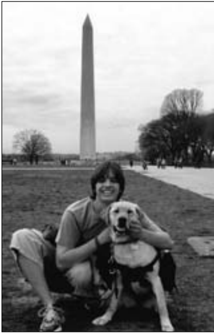
This is how a puppy home can say goodbye—look at the joy in this team!