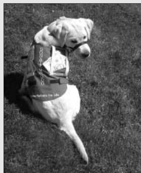
We have started a new program with donation dogs. These dogs are out in the public to raise awareness of our program and trade puppy kisses for cash. Some people will trade money for a chance to smooch with a pooch!