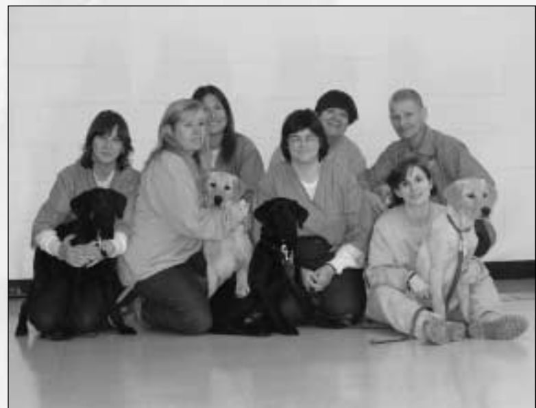
Independence for the disabled thanks to inmates in our Prison Puppy Raising Program.

To learn more about the prison puppy raising program or to get involved, call CPL!