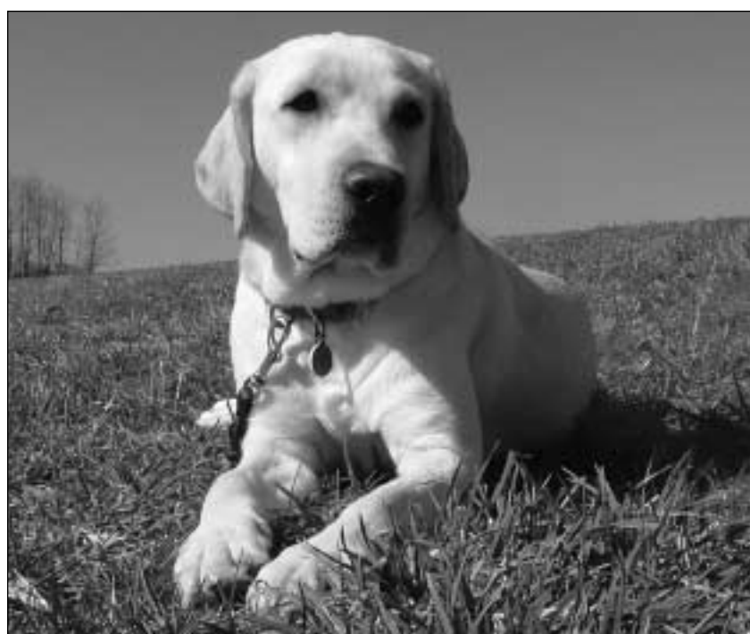
One of our Kennel Dogs pondering his future with his partner.

Most of the people who tour our kennel are amazed at how clean, bright, and friendly it is. It is NOT your standard kennel! While we feel that it is important that our dogs spend their second year of training here with us, we want to make that second year as fun and educational as possible for them. The kennel offers us the opportunity to provide a very structured environment for learning, play, and care. It also makes possible consistent supervision and management. We learn a lot about our dogs as they mature during their second year through the carefully planned and supervised activities at the kennel.