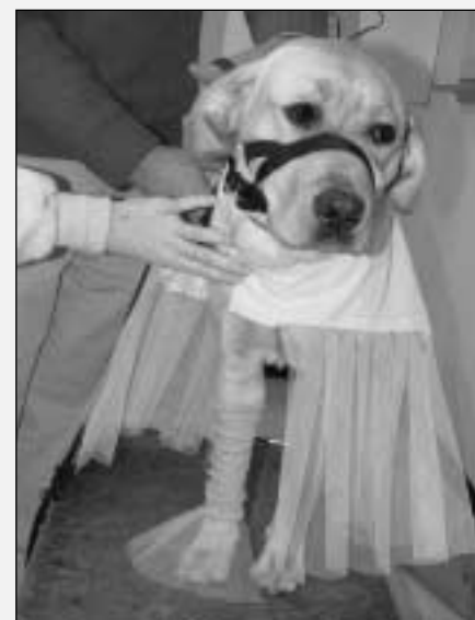
It's hard to be a super model.