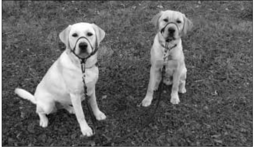
These puppies in training are waiting to learn something new and exciting. Won't you come and volunteer to be a puppy home for CPL and take one of them home with you?

If you are receiving duplicate copies or if you would like to be removed from our mailing list please call (610) 869-4902.